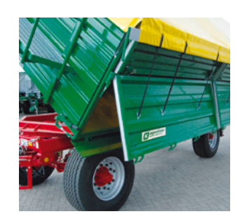
HKD 290 - 18 tonnes total permissible weight

Steel side panels with rubber seals are available in our special models with a total weight of 14 to 18 tonnes.