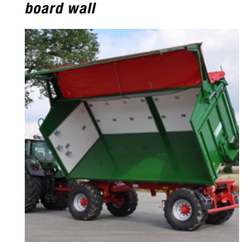
The hydraulic opening side

The matched balance between the stable chassis and the optimally calculated tipping points ensure that you have the best possible tipping stability. The overload protection for the parabolic spring suspension on the rear axle offers additional safety if the load slides out poorly or on one side when tipping to the rear. The tipping system has a cardanic mounted telescopic cylinder with plenty of redundant performance. When tipping to the rear, a tipping angle of 45° can be achieved. Dampeners absorb unwanted impacts and noise from the tipping bridge during travel and protect the whole vehicle frame.